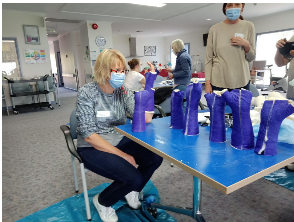
Edenhope Fracture Management course

“An education isn't how much you have committed to memory, or even how much you know. It's being able to differentiate between what you know and what you don't”